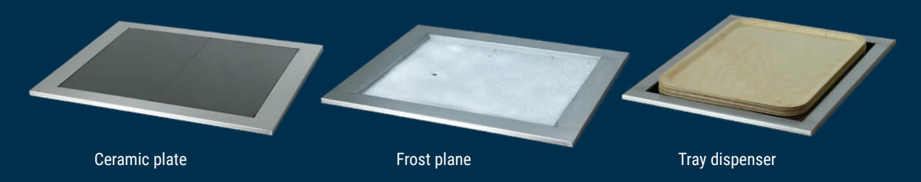
Each Luna unit can be customised to your needs.