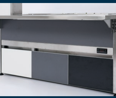
Standard colors white, grey and black