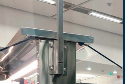
Power supply from ceiling

Make meals easy and efficient with customised Luna serving trolleys