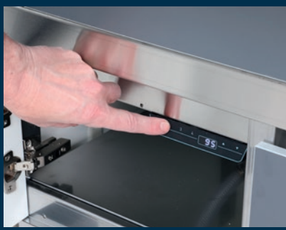
Height adjustment placed inside the cabinet