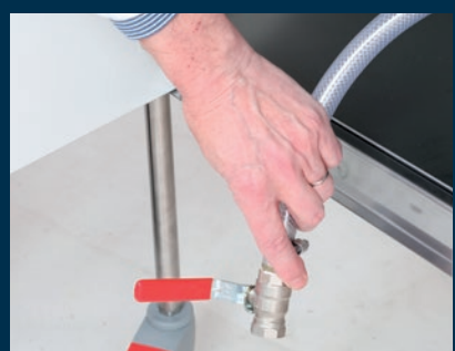
Drainage pipe for the basin