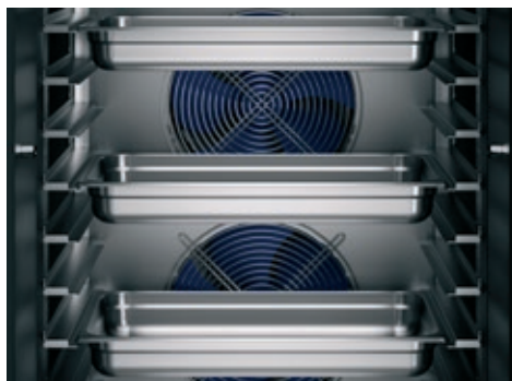
The multi-step rack allows to change the gap between guide rails. Pictured the rack suitable for GN1/1 and EN 600x400 trays.